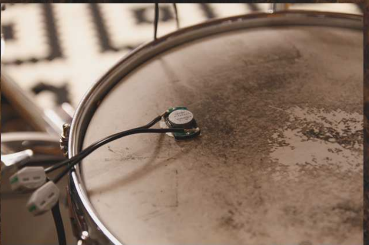
Some ethnic and orchestral drums & percussions like taikos, tom toms, tablas, wood and temple blocks, castanets etc. recorded with different types of sticks/mallets, pipes and combined with the multi mic positions.